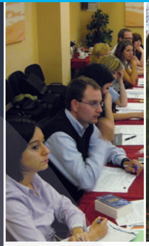
PICTURES FROM THE PARTNER REGIONS: (clockwise from left upper corner) Malta; Central Hungary; Cornwall, UK; La Rioja, Spain; third Steering Committee Meeting, Sofia, Bulgaria.

"The Marche Region is implementing several projects on energy efficiency and renewable energy and is working for the adoption of the final document of the Regional Plan for Climate, ensuring the coherence of mitigation and adaptation actions. Participation in the RSC project allows the Marche Region to share experience, improve knowledge on regional and local impacts, and work towards a low-carbon future."